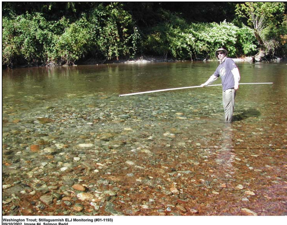
Washington Trout; Stillaguamish ELJ Monitoring (#01-1193) 09/10/2002 Image #4 Salmon Redd